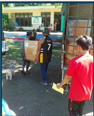
Boxes of supplies arriving at Consuelo Elementary School.