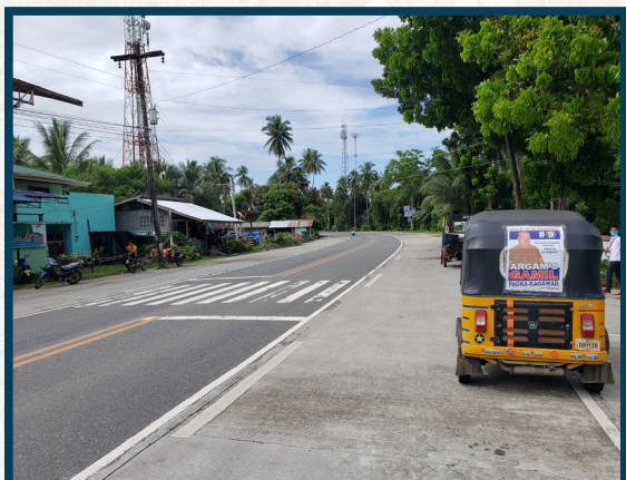
National Hwy at Brgy Consuelo