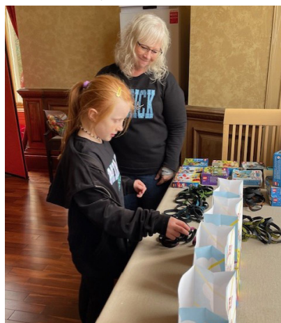
Picking out bracelets that have verses on them