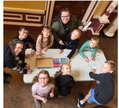
Craft - making bookmarks