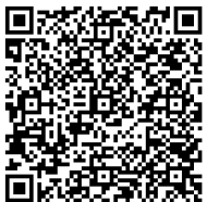
SCAN HERE FOR GIVING PAGE!