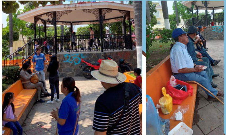
Street evangelism two weeks ago and today Sept 16th, 2023

Please pray and let us know even if it a NO at this time. It would help us to know that. You have shared so much already with us and we are very thankful for your faithfulness.