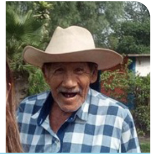
New believers in El Molino on Sept 16th, 2023. There are 5 more that did not get pictures taken

We are going to be celebrating for the first time our anniversary of 35 years of ministry in this area of Tlajomulco.