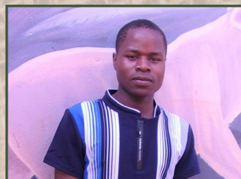
OWEN - National Polytechnic, Building and Technology

LOVING AND REHABILITATING THE ABANDONED, ORPHANED, ABUSED, AND STREET CHILDREN OF KENYA.