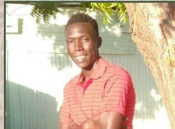
FRANCIS - Medical Training College to be a Health Assistant