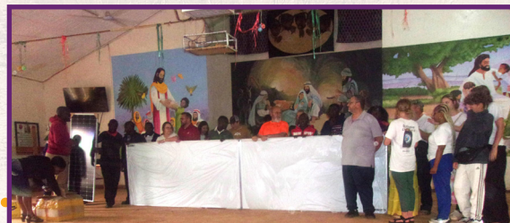
The team presented gifts to the Farm – 4 solar panels with batteries and solar charge, whiteboards, course books, and other supplies.