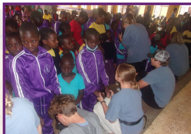
Praying for and blessing each child, even the community kids who attend our school.