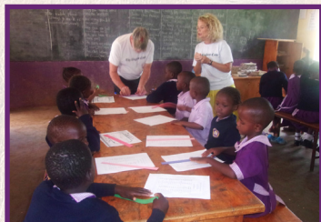
VBS Bible stories, crafts, and activities for each class!