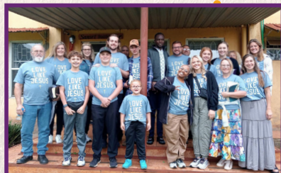
The "Love Like Jesus" Team!

What a blessing to have this team of 19 visit the Farm! They encouraged the children, did VBS activities and crafts, taught them new songs and dances, played board and field games, and prayed for all the kids. THANK YOU VFC!!