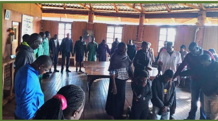
Staff praying for the students.