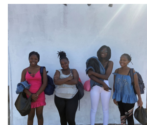
New Princesses at our Transformation Centre

REVIVAL - THE FISH ARE JUMPING IN THE BOAT: We marvel at the Lord’s love and His ability to make all things new. He is busy restoring innocence, youth and families and we can only praise Him for it. He is merciful, kind, powerful and present. It has been so fun to see the way He is transforming and restoring the lives of the Princesses. We have had so many new girls respond to the Gospel. They are growing and sharing what God has been doing in their lives with their friends, and their enthusiasm and excitement about Jesus and what He has done for them is contagious!!! We had a weeklong school holiday camp at the Transformation Centre in April and after that they came asking to stay weekends. They attend High school courses and discipleship lessons at our Day Center in town during the week and then come stay Friday-Sunday afternoon at the Transformation Centre. They can make money doing odd jobs if they choose to, and they receive extra help with schoolwork and enjoy Worship and Bible lessons. We have been teaching them how to paint and they are learning agricultural skills.