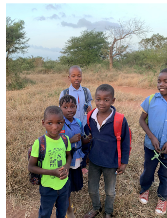
Kids going to school in Kululah

Thank you for your generous prayer and financial support. We could not do all that we do without your help. It has been a fruitful and inspiring season. Since November last year we have been officially “Restructuring” our Transformation Centre and making the necessary changes to our buildings, staff, documentation, and policies to comply with changes to the law and requirements for centers housing children. This has brought great growth, relief, and renewed vision and perspective. Thank you for your continued support as we work our way through the list of security and maintenance items at all our locations. We endeavor to provide the best and most secure care for these precious Princesses and their children. We had to reintegrate all but 2 of our youth. We were allowed to receive 2 of the kids who had been reintegrated back for schooling purposes due to flooding here in February and March. It has been a huge adjustment for all of us. Talk about empty nest syndrome...it was a mass exodus!!! We can see the Lord’s Hand and His heart in the whole 2-year process of transitioning the older kids to Kululah and training them as we were, for life outside the center. We are pleased to report they are all doing well. Some of the youth will join us for extra Math, Chemistry and Physics lessons on Saturdays and they want to continue with the Dance Upon Injustice programs.