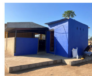
New kitchen storage area