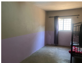
Divided girls dorm into two rooms