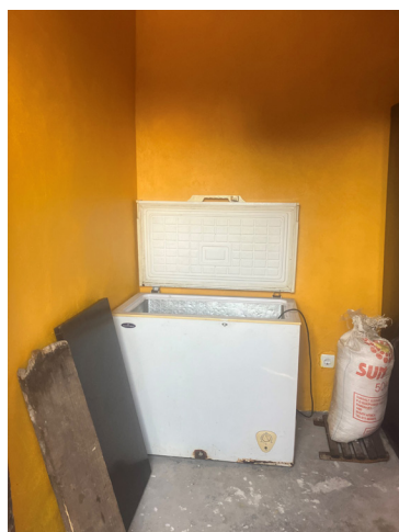
Kitchen storage room