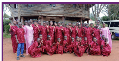
Taarab Dance Choir proceeded to the Regionals!

We started in the sub-county level for the Music Festival, presenting 15 items. The competition was stiff ~ there were around 100 presentations! The Challenge Farm kids scored Position 1 in the Taarab dance, Singing Game, poem recitals in English and Kiswahili (for upper primary) and in English for ECD students (thru age 5)! We took Position 2 in the Sacred and Scottish dances, and the poem recitals for upper primary and middle school. The students were able to advance to the county level! The Taraab Dance Choir took Position 2, and advanced to the regionals to score Position 3!