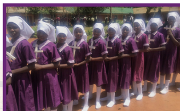
Sacred Dance Group took Position 3 in the County level