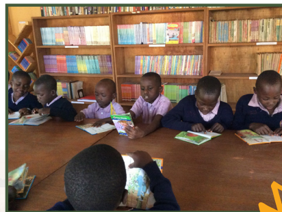
New storybooks for our library!