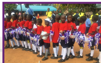
Singing Game Group scored County level Position 6!