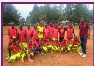
Boys' soccer team