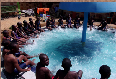
left: Grades 4 and 5 class trip to Eldoret