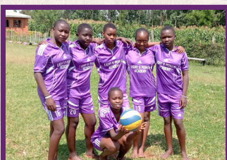
Girls' volleyball team

Students also participated in soccer and volleyball competitions at the sub-zonal level. The girls' volleyball team advanced to Zonal level, taking 1st place!