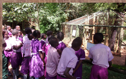
right: Grades 2 and 3 class trip to Ndura Park in Kitale