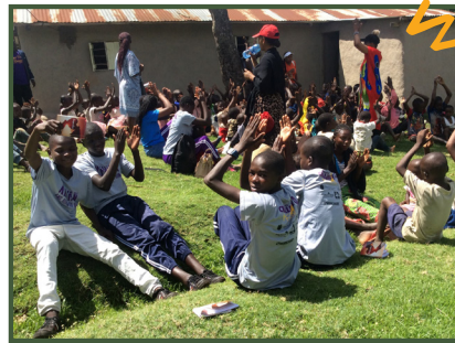
Outreach to Vamia Village in Birunda