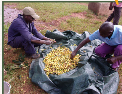
We harvested loquats. The kids love them!