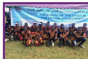
Students participate in Day of the African Child