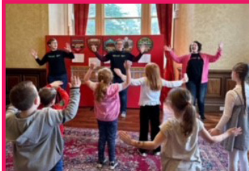
Music with actions

One of my favourite highlights from the day was during music time. The kids were singing so loud and it filled the room. To me, there is nothing better than children worshiping Jesus. As they worship Him, He pours Himself out onto them. It is so sweet to watch!