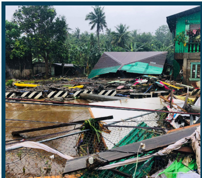
Oroquieta City Christmas 2022

the Philippines are always asking when we are returning and can't we stay longer. It's nice to be wanted!