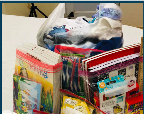
Selection of items we ship about to be distributed