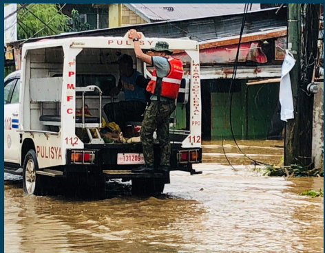
Police offering some assistance