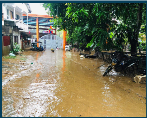
Oroquieta City Street