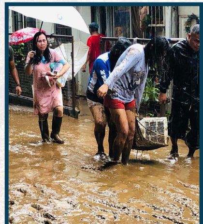
Christmas in Oroquieta 2022