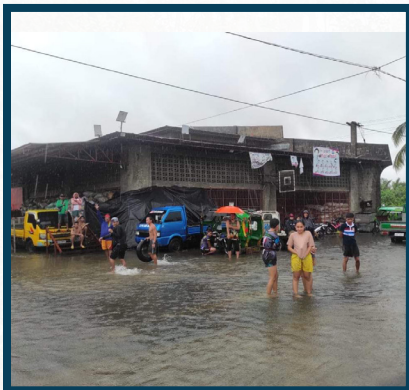
Gingoog City Christmas 2022

At the time of writing, we are in Jesus' Passion week, that has both the tragic horror of death by crucifixion and the gloriously outstanding triumph of resurrection life! That very same life that now resides in each of us who have given our lives over to the Lordship of the Messiah, Christ is Risen, and we are the fruit of His resurrection power. He was the first fruit of the resurrection and because He lives, we are made ALIVE in Him! Happy Resurrection Day everybody!