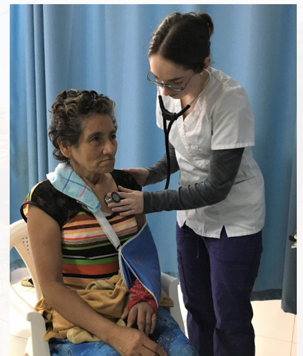
Medical Missions at work