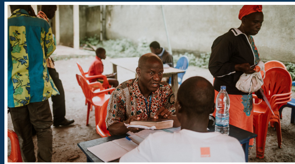
One on One Evangelism After Medical Treatment