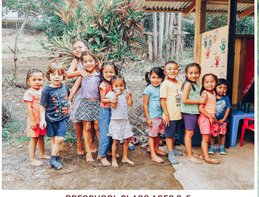
CHRISTMAS OUTREACH 2019