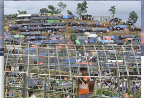
REFUGEE CAMP IN BANGLADESH

PLEASE WALK WITH US AT GLOBE INTERNATIONAL AS WE SEEK TO BRING GOOD NEWS TO HUNGRY PEOPLE AROUND THE WORLD.